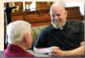
Supporting the needs of our senior priests in the Diocese of Rockville Centre.

The mission of St. Pius X Residence is to provide a nurturing environment that respects and cherishes the lifelong commitment of our beloved priests. The Residence strives to create a warm and supportive community where they can enjoy their retirement years with dignity, surrounded by like-minded individuals who share their dedication to faith.