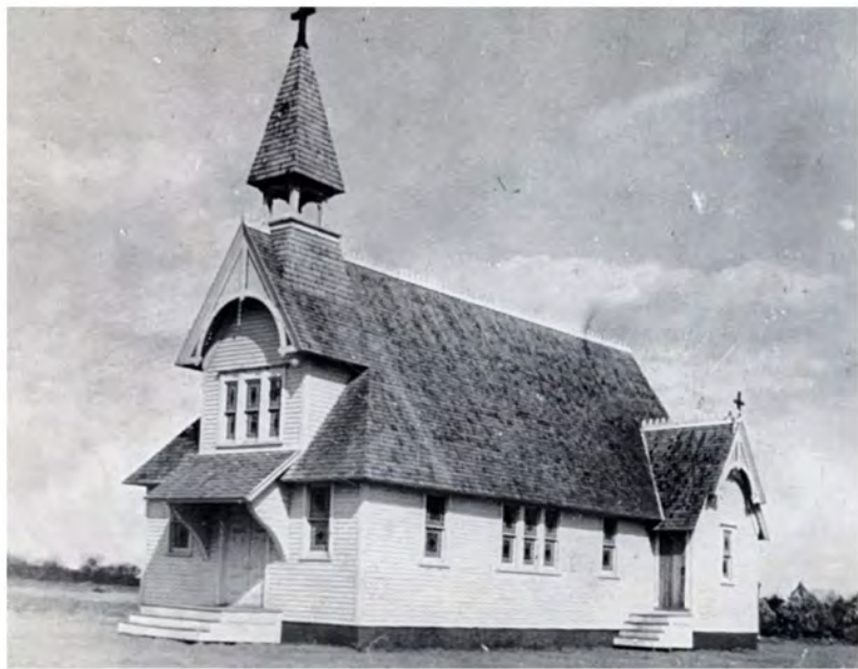
St. Mary's, Our Lady of Grace Church, our first parish building, located in East Moriches near Montauk Highway and Frowein Road intersection, as it appeared at its dedication in 1886.

Below: St. Mary's Church building as it appears today — until a few years ago, a vitamin and health food store and now a private home.