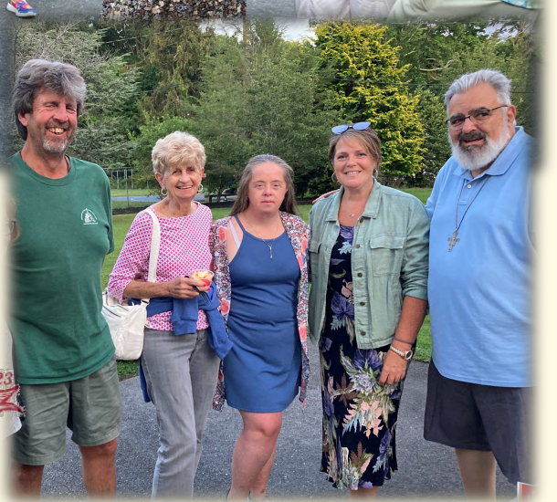
1898 ~ St. John the Evangelist Parish... Celebrating 125 years ~ 2023