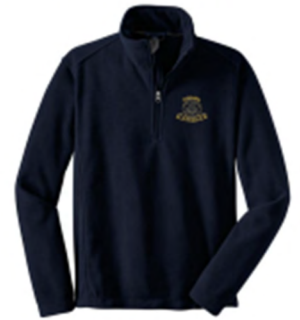
Fleece 1/4-Zip Pullover