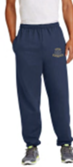
Sweatpant With Pockets