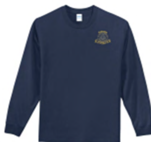
Long Sleeve Tee