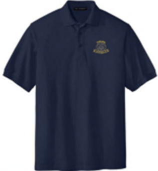
Silk Touch Polo