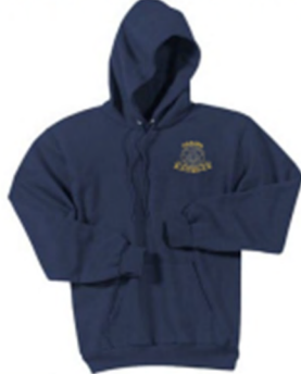
Pullover Hooded Sweatshirt