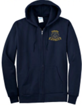
Full-Zip Hooded Sweatshirt

Online Store Deadline: Thursday June 29th, 2023 (11:59pm EDT)