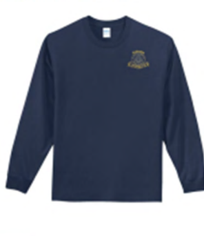
Long Sleeve Tee