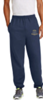
Sweatpant With Pockets