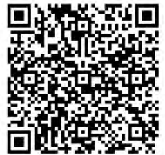
CAMPER QR Code