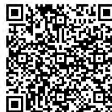
CAMPER QR Code