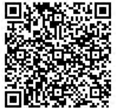
CAMPER QR Code