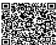
Volunteer QR Code

In order to run our VBC safely and efficiently we need lots of adult and teen volunteers. Please contact Carolyn Lapham ( clapham@sjecm.org ) if you are interested in volunteering or use the QR Code in the left. Teen volunteers will receive community service hours.