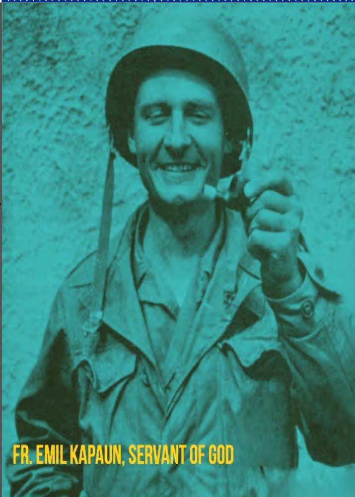
FR. EMIL KAPAUN, SERVANT OF GOD

ST. JOHN THE EVANGELIST R.C. CHURCH 25 OCEAN AVE. CENTER MORICHES, NY 11934